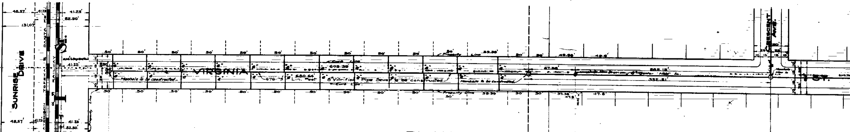
PLAN Scale — 1" = 40'

DATUM All Elevations shown in Red Ink are in Feet and are above a Plane which is 1045.28 Ft. below the City Bench Mark as established by Ordinance No. 383, City of San Bernardino.